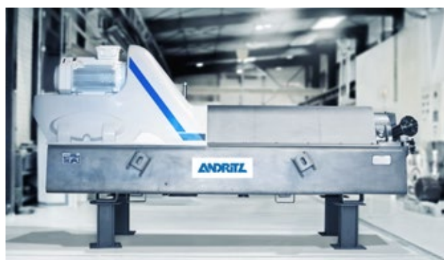
ANDRITZ decanter centrifuge F

While you are saving time in production, there is no need to lose time during maintenance! The in-line design of our ANDRITZ decanter centrifuge F allows easy dismantling (requiring only basic lifting equipment and an operator). This configuration provides cost savings in maintenance and handling.