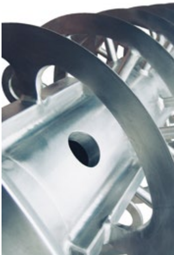
Unique scroll design